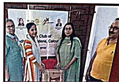
DISTRIBUTION OF SEWING MACHINE on 4th June 2025