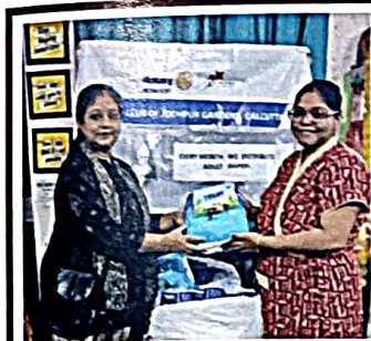
Distribution of 130 pcs Diapers for the elderly at "Alor Disha" (Ongoing Project) Old Age Home in Kolkata on 5th June 2025