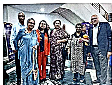
RC Jodhpur Gardens Calcutta members attended the Changeover Ceremony of RID 3291 on 1st July 2025 at National Library Bhasa Bhawan Kolkata