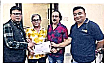
Members attending the Blood Donation Camp supported by Many Rotary Clubs of RI Dist 3291 on 1st July '25 at Rotary Sadan Kolkata